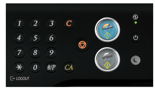
Separate print buttons for B&W and Color allow users to selectively manage use of color