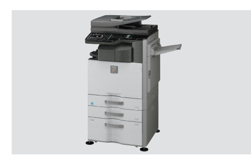
Available paper capacity stores up to a maximum of 3,100 sheets with options