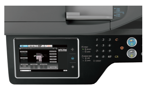
High-resolution touch screen with Stylus pen for easy point-and-touch operation