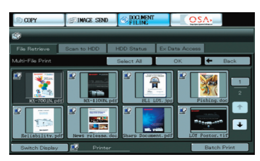
Sharp's easy-to-use Document Filing System with thumbnail preview