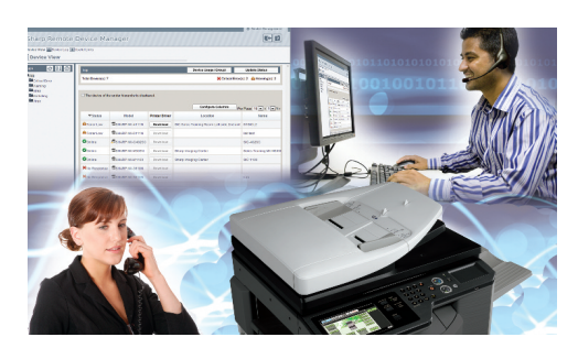
Sharp Remote Device Management