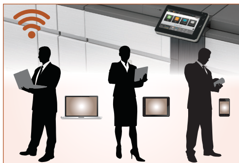
Built-in wireless network interface for convenient scanning and printing from mobile devices.