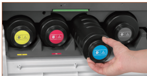
On-the-fly toner cartridge replacement while your job is running helps maximize your productivity.