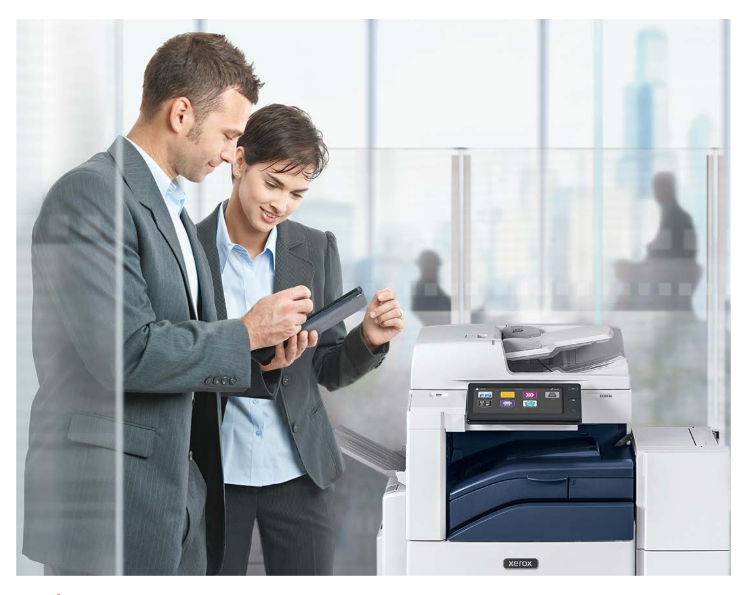
XEROX® EC8036/EC8056 COLOR MULTIFUNCTION PRINTERS

Xerox® EC8000 Color Multifunction Printer Series